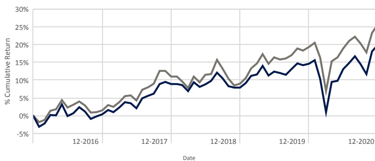
— Destiny BCI Prudential Fund of Funds (A) — Fund Benchmark